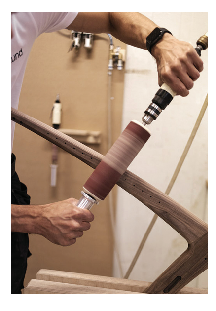
↓ A worker sands the Krysset lounge chair